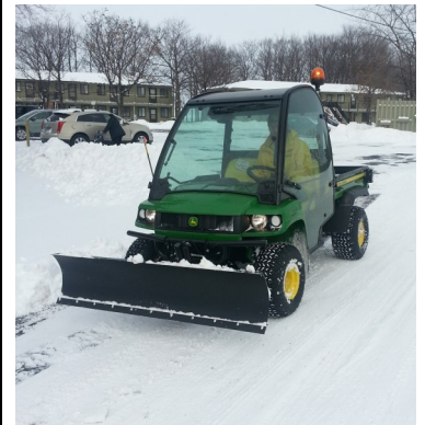
Casey Fuller on his way to remove snow

The Gator is equipped with a plow for snow removal and a dump box for year-round grounds maintenance.